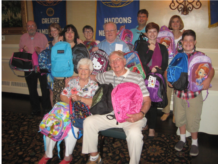
Displaying the largesse of backpacks with school supplies, the Haddons Club reports that Operation Backpack was a great success.